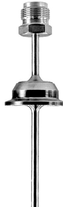
Thermowell with Aseptic Connection Model SW200F

Ø 6 x 1 mm and Ø 6 x 1.4 mm for probe Ø 3 mm with electrical thermometers 2) Ø 8 x 0.9 mm for probe Ø 6 mm with electrical and mechanical thermometers Ø 12 x 1.5 mm for probe Ø 8 mm with mechanical thermometers