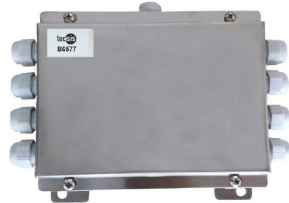
Junction box, model B6577